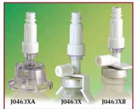
ULTRASITE® Valve (Two-way) for aspiration or injection. DEHP-free. Latex-free.