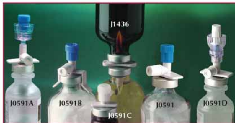
MINI-SPIKE® Dispensing Pins. DEHP-free. Latex-free.