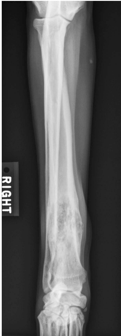
FIGURE 1 Radiographic view of the right front limb of a dog with no visible swelling and grade 2 lameness reveals a proliferative, osteolytic lesion of the distal radius.

the tumors listed, cannot be used to predict outcome in individual patients, and are not intended to serve as a primary resource for making clinical decisions.